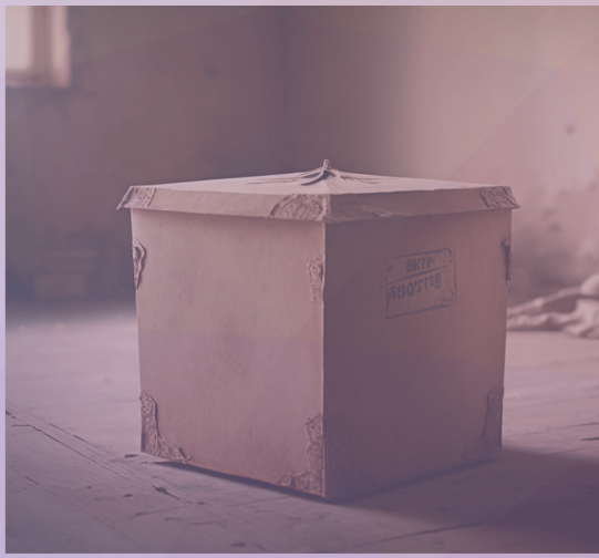
A Unique Delivery