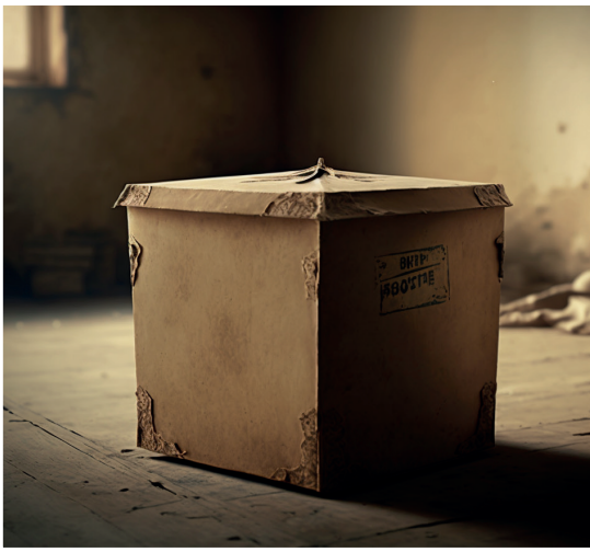
A Unique Delivery